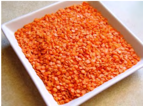
Figure 1. Lentil

Lentil was collected from Monywa Township, Saging Region, Myanmar. Ethanol from (BDH Chemicals Ltd), Sodium hydroxide and hydrochloric acid of analar grades were used.